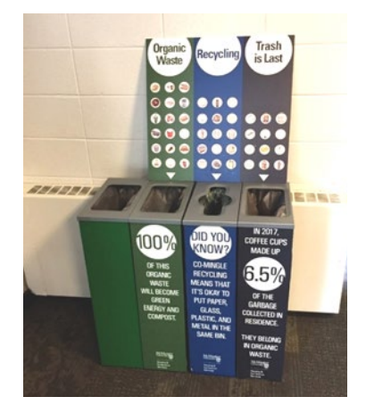
Busch Systems Spectrum containers in McKay Hall. Streams include organics, recycling & waste.

Hedden Hall : This residence hall collects waste and recycling only. This resulted in an average diversion rate of 31%. The weights of each stream translate to 31% recycling and 69% waste. 72% of the waste stream was compostable material, 42% of the recycle stream was compostable material.